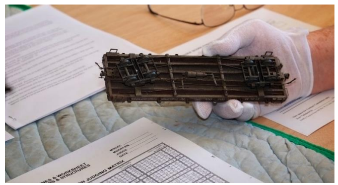
All models receive the white glove treatment as points are awarded based on a judging matrix.