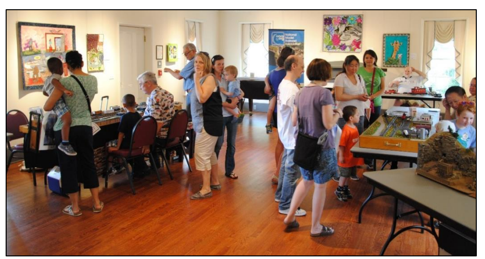
CPD 13 members share the fun of model railroading at National Train Day

In addition to the displays by CPD13, the event included railroad exhibits, face painting, food trucks and The Cary Band playing as the 10:05 Amtrak made its morning stop.