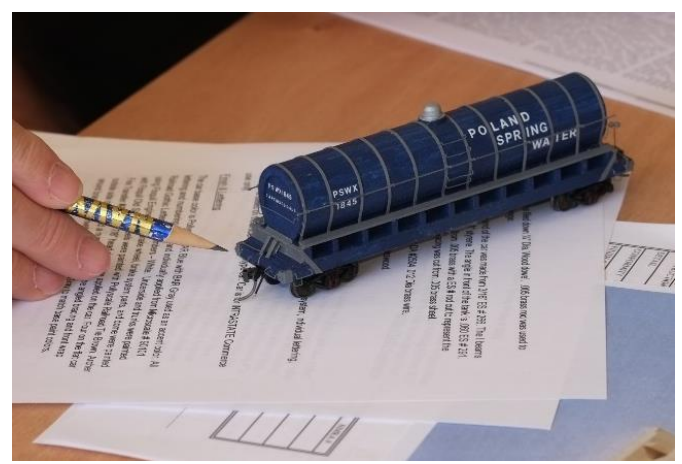
Fine details score points as judges evaluate a water tank car scratch-built by Gene Sing.

Modelers prepare a thoroughly researched background document on the prototype for each submission, along with construction photos.