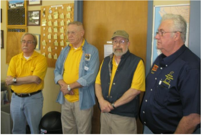
Some of the First State MRR Club members waiting to lead a class of scouts.

Then the Scouts were split into four groups of about six boys each. I attended the class on April 12th and provided the club with the MER's HO Scale R F & P RR box car kits. These kits are needed for the badge's requirement 8a2- which states "Build a model railroad car kit or one locomotive kit."