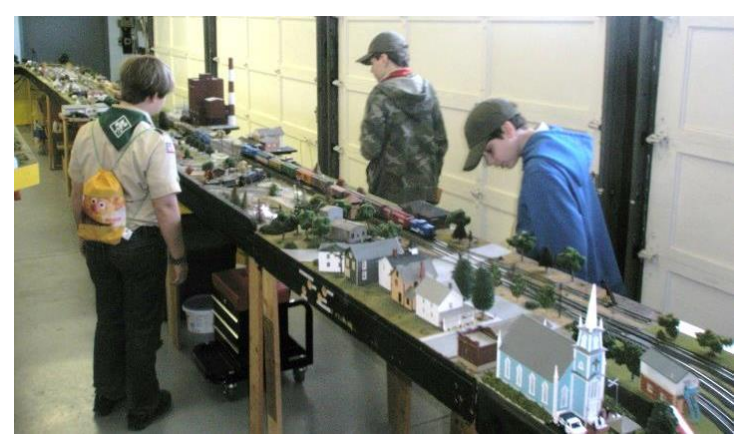
Scouts follow a train around the DC layout.

The large but smaller layout is about 20 feet by 20 feet and is on modules and operated for Digital Command Control. These are both fun to operate with long trains and some switching maneuvers as part of it. The members of the First State Model Railroad Club have constantly provided a quality program for the scout to learn and earn the Boy Scouts Railroad Badge. This year was no exception. Good going GUYS!