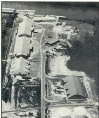
Georgia Ports Authority, Bainbridge

Unique to the GSWR is its access to the Savannah ocean port as well as three river ports at Bainbridge and Columbus, Georgia and at Eufaula, Alabama. This gives our customers waterway access to agricultural and industrial markets worldwide.