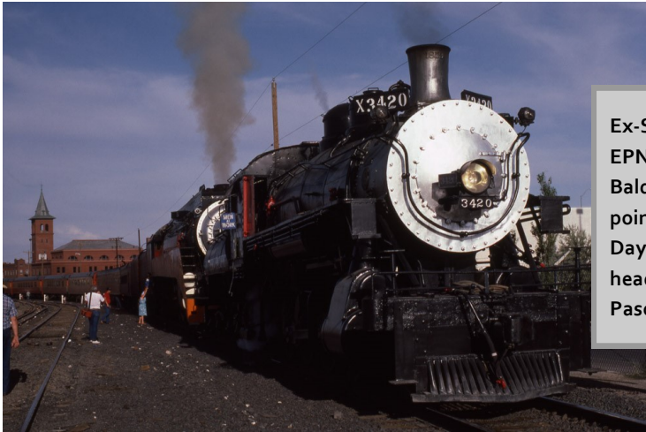
Ex-SP 3420, EP&SW 271, EPNE 171, a 1904 Baldwin 2-8-0, on the point of the Louisiana Daylight in 1984, double-heading with 4449 at El Paso.

Unfortunately, I misplaced the credit for the photographer for this photo.