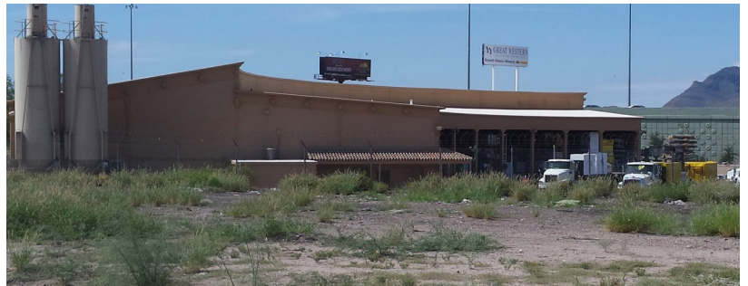
This is the original EP&SW roundhouse in Tucson, now a building materials warehouse.